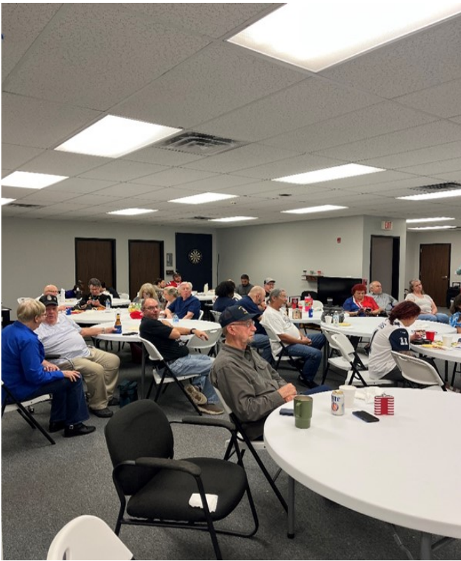
American Legion Rider Chapter 164 Hosts Super Bowl Party

American Legion Post 164 Legion Riders Chapter hosted a Super Bowl party for post members and their families. The event was a huge success! The head count exceeded 40 people. There was food galore, darts, 50/50 raffle and lots of fellowship. We are looking forward to making this an annual event.