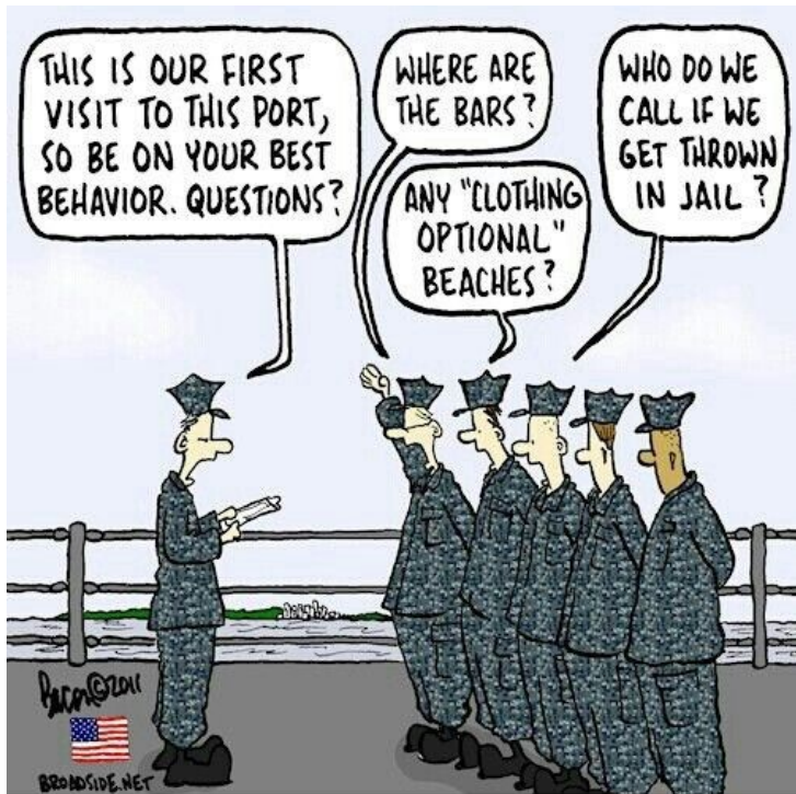
The Chief wasn't convinced his message was getting through.